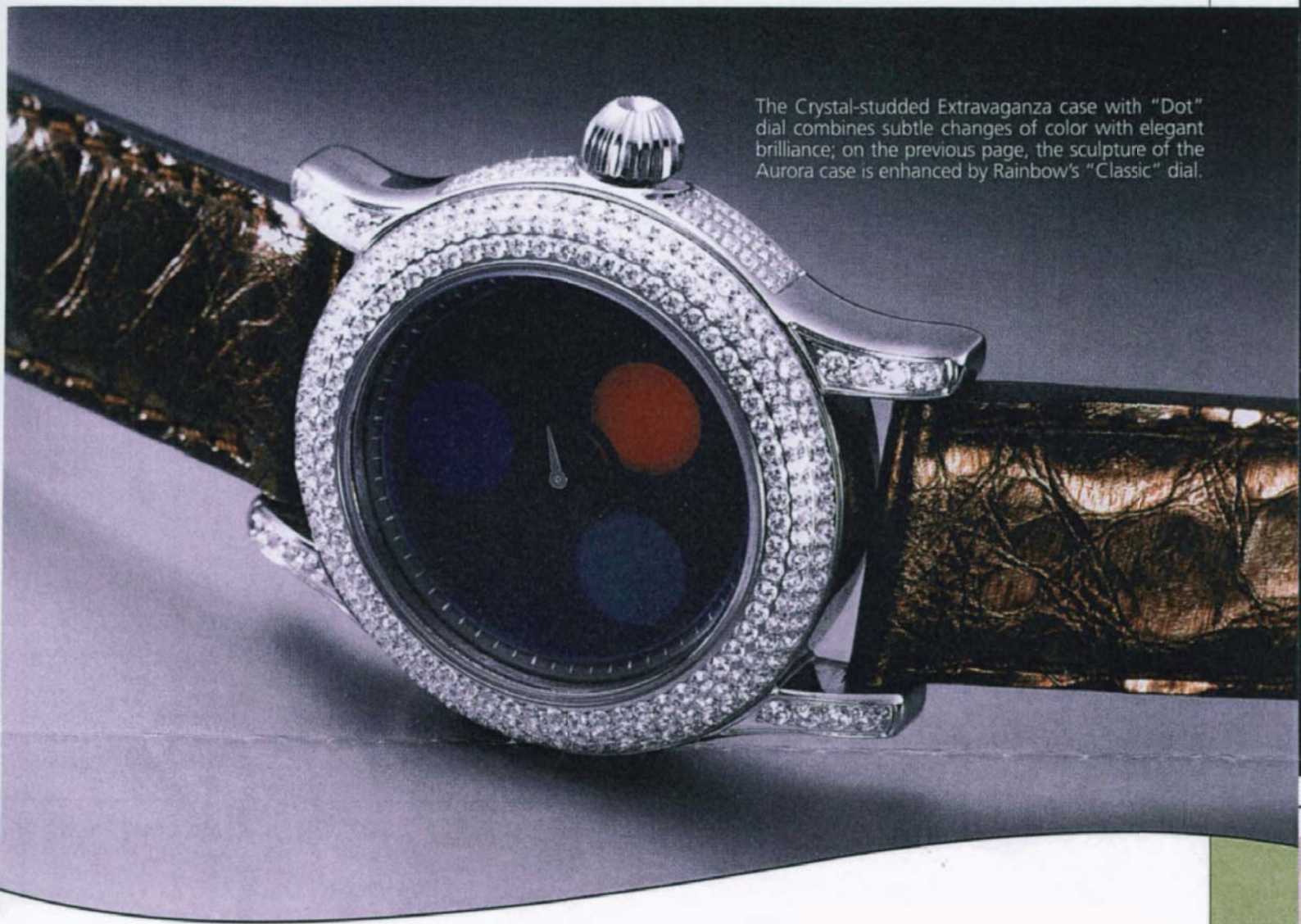
The Crystal-studded Extravaganza case with "Dot" dial combines subtle changes of color with elegant brilliance; on the previous page, the sculpture of the Aurora case is enhanced by Rainbow's "Classic" dial.

moods as the colors—from white and yellow to deep violet and blue—overlap and engage one another. The variety of color is astounding and, as Rainbow indicates on its web site, is indeed "an innovative and absolutely new style...of visualizing time."