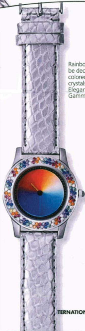
Rainbow cases can be decorated with colored Swarovski crystals as on this Eleganza Crystal Gamma model.